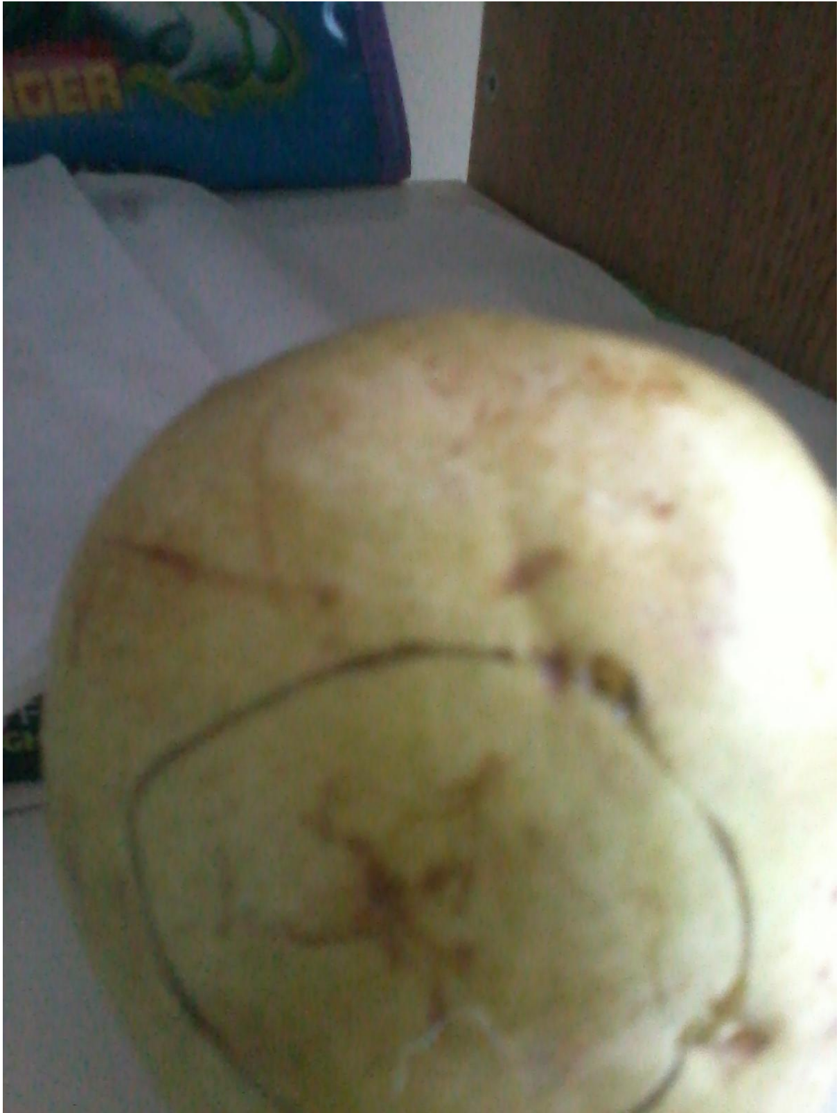
SCAN OF THE MIRACLE PEAR